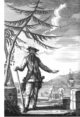
Figure 2: Blackbeard the Pirate: this was published in Defoe, Daniel; Johnson, Charles (1736) "Capt. Teach alias Black-Beard" in A General History of the Lives and Adventures of the Most Famous Highwaymen, Murderers, Street-Robbers, &c. to which is added, a genuine account of the voyages and plunders of the most notorious pyrates. Interspersed with several diverting tales, and pleasant songs. And adorned with the Heads of the most remarkable Villains, curiously engraven on Copper, London: Oliver Payne, pp. plate facing p. 86.

Challenge problems are optional and should only be attempted after completing the previous problems.