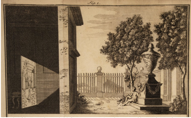
llustration of the camera obscura principle from James Ayscough's A short account of the eye and nature of vision (1755 fourth edition) from Wikipedia

Its effect is meant to invoke an experience similar to being inside a camera obscura or looking at a ground-glass of a large format camera for those who have that particular reference point. It is referencing a moment when the world turns into an image. The image is still full of life and active. It is not yet fixed in perpetuity. It is still alive with unknown possibilities.