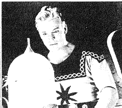
Buster Crabbe as Flash Gordon in the interior of one of the series' ultra-realistic space vessels.

Dewes, in fact, is known as one of the best dangles in Hollywood's elite special-photographic-effects community.