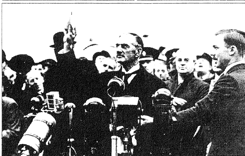
British Prime Minister Neville Chamberlain holds aloft his hard-won obliteration treaty with Hitler.