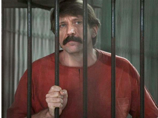
Figure 1: Viktor Bout in American federal custody once more.